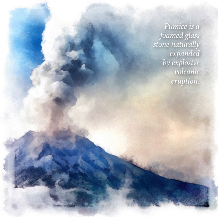
Pumice is a foamed glass stone naturally expanded by explosive volcanic eruption.